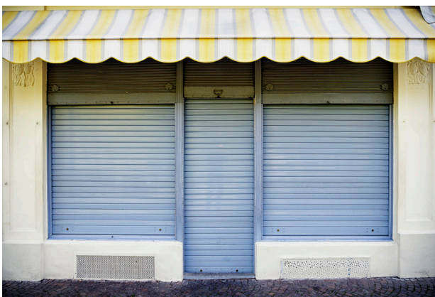
Plywood (top) should only be used as a last-minute alternative, while roll-down shutters (bottom) are the easiest to activate.

To determine the best option for your facility, consider the following questions regarding advanced deployment: